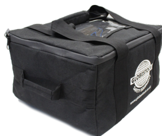
Holdall bag GSE-H/ALL